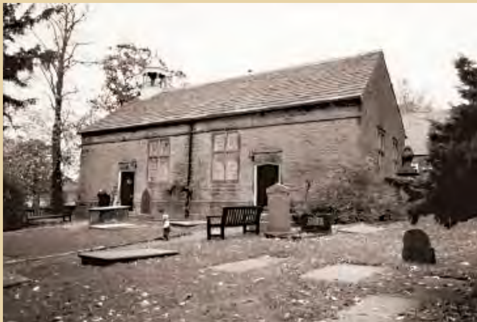
Rivington Unitarian Chapel