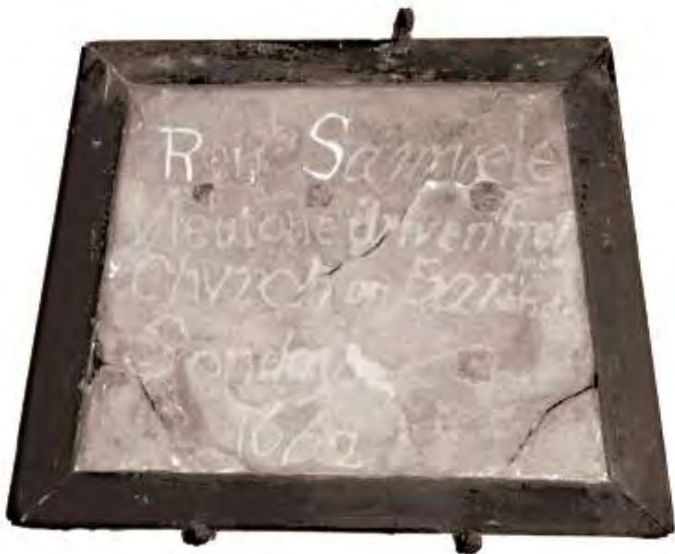
Broken Tablet mounted on the Chapel Wall