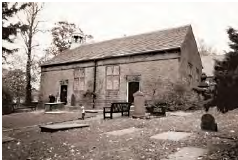
Rivington Unitarian Chapel