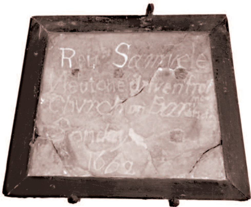
Broken Tablet mounted on the Chapel Wall