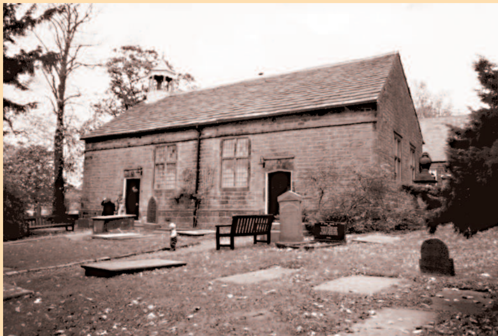
Rivington Unitarian Chapel