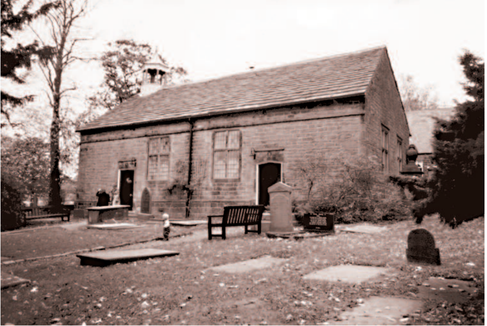
Rivington Unitarian Chapel